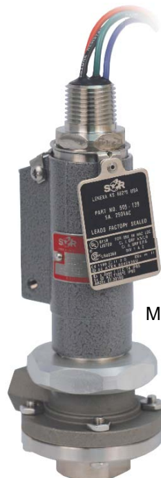
Mini-Hermet Pressure Detector

For latest revision, go to www.sorinc.net