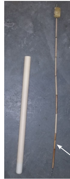
Previous industrial thermocouple that needed to be replaced